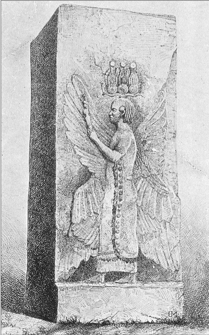
A bas-relief sculpture of King Cyrus the Great of Persia