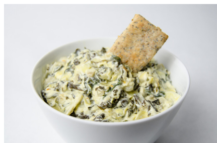
Spinach Artichoke Dip