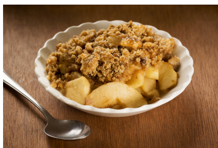
Slow Cooker Apple Crisp from allrecipes.com